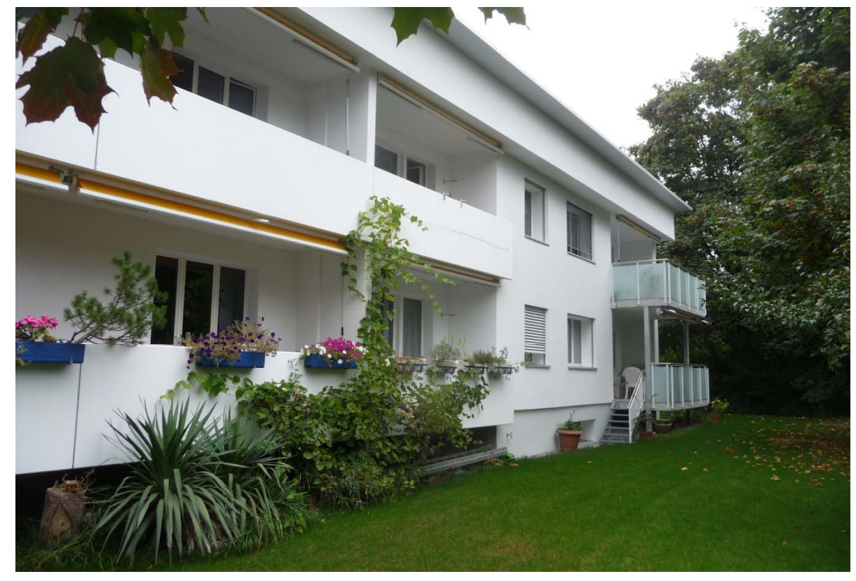
IEA – SHC Task 37 Advanced Housing Renovation with Solar & Conservation