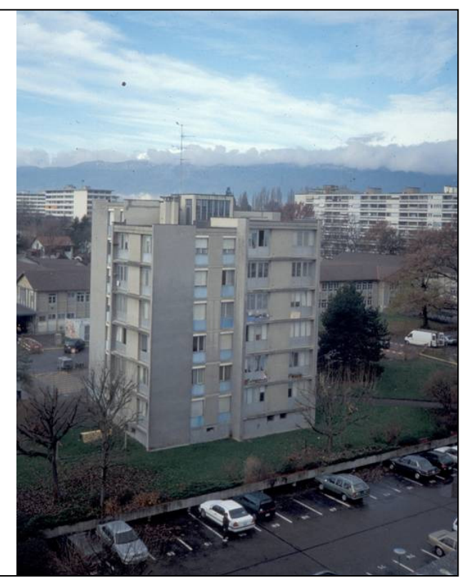
IEA – SHC Task 37 Advanced Housing Renovation with Solar & Conservation