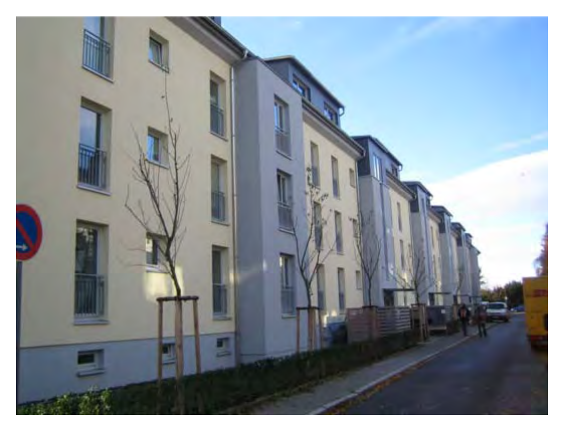
IEA SHC Task 37 Advanced Housing Renovation with Solar & Conservation